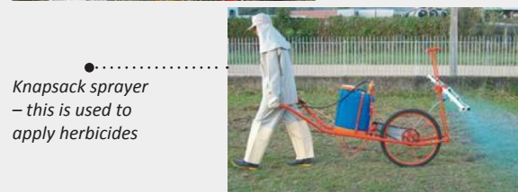
Knapsack sprayer – this is used to apply herbicides