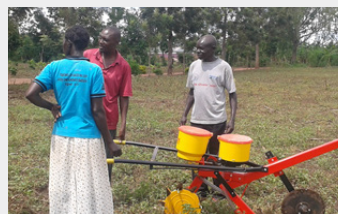
Ripper planter (with planter and fertilizer attachments)

Draught animals or a tractor: for smooth and effective ripping one may need two strong oxen. On heavy soils and extensive areas or for deep ripping (sub soiling) one may need a tractor.